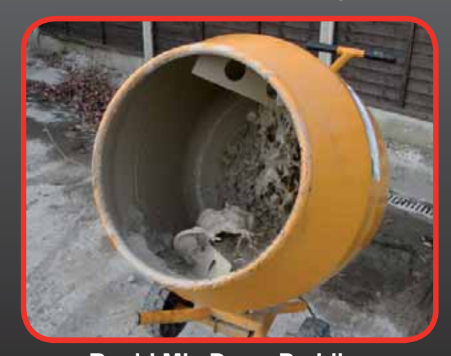
Rapid Mix Drum Paddles