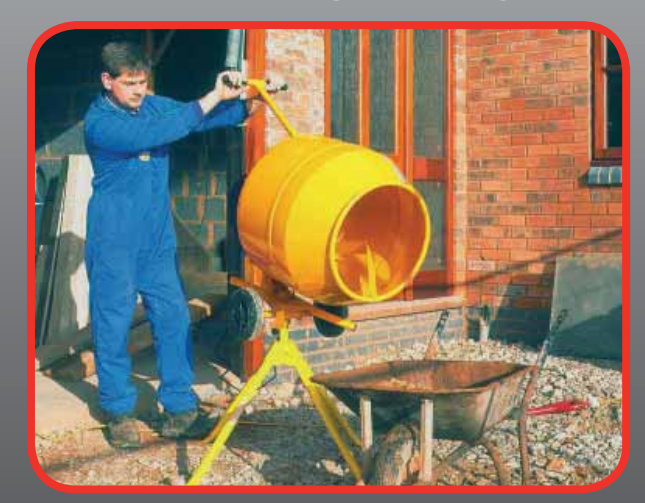
Ideal for On-Site Usage